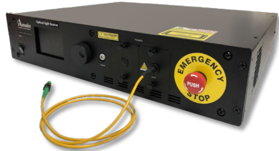
2U Rackmount Casing